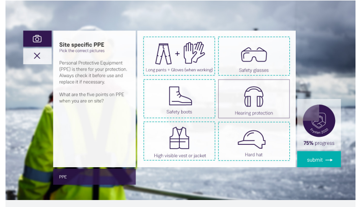
Siemens - Site Induction