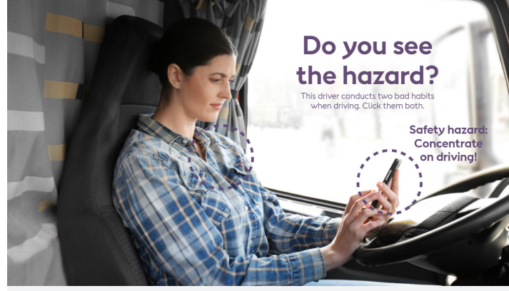
Ørsted QHSE Induction