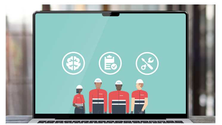
Ørsted Global Site Induction

Prioritising safety, we help you ensure that technicians are updated and certified, promoting a safer working environment for all.